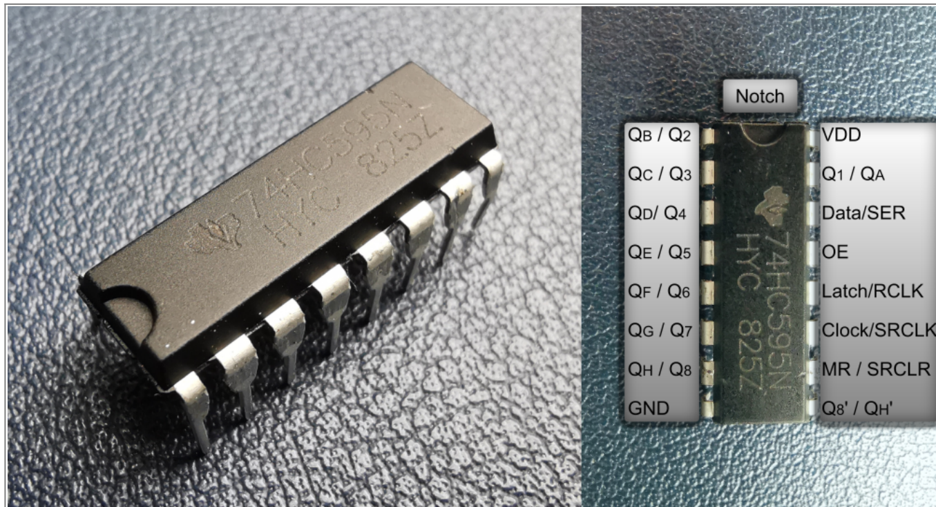
Figure 1 SN74HC595(N) Shift Register and pinout.