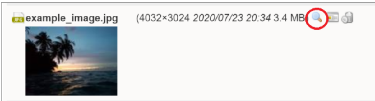
Figure 4: The magnifying glass opens the new tab

Afterwards you need to upload your image to dokuwiki and get the image link. You can get it when you click in the dokuwiki media files onto the magnifying glass which opens a new tab with the image in full resolution. You need to copy the URL from the tab and save it for later.