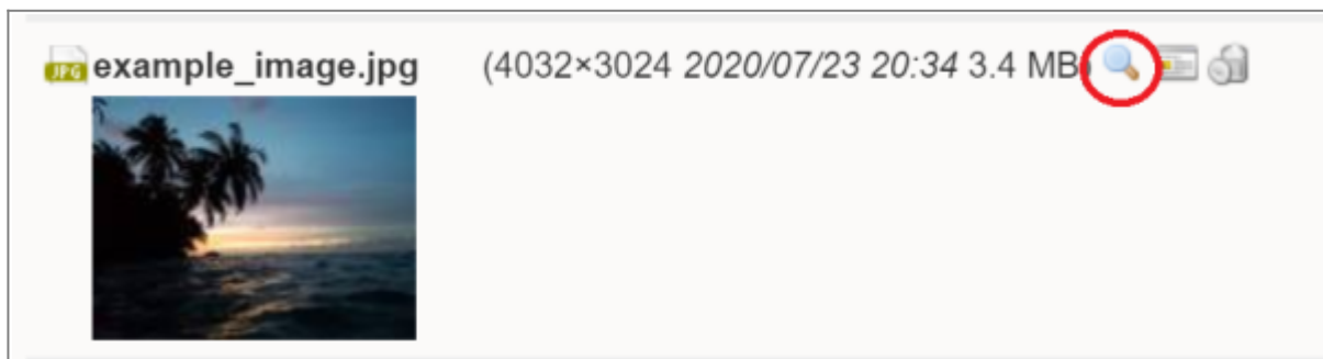
Figure 4: The magnifying glass opens the new tab

Afterwards you need to upload your image to dokuwiki and get the image link. You can get it when you click in the dokuwiki media files onto the magnifying glass which opens a new tab with the image in full resolution. You need to copy the URL from the tab and save it for later.