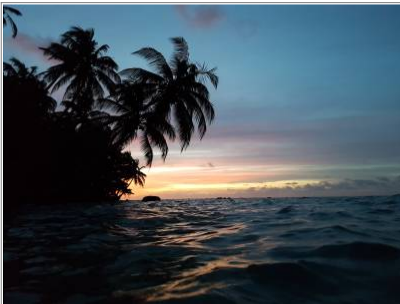
Figure 1: Our example image.

Below you see an image I use here as an example. I want to make three clickable areas which link to different webpages. The palm tree will link to google, the sunset to Wikipedia and the sea to YouTube. Of course, you can change the image and the links however you want. I used it in my project to make an interactive navigation to the different pages of my report. You can for example add an image of a schematic of your project and add links leading to the different pages describing the components.