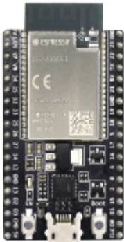
Figure: ESP32-DevKitC_V4 with ESP32-WROVER-B,

https://www.espressif.com/sites/default/files/dev-board/ESP32-DevKitC%28ESP32-WROVER-E%29_0.png