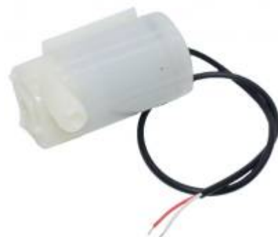
Figure: Submersible water pump, https://cf3.s3.souqcdn.com/item/2018/09/25/38/88/28/88/item_XL_38882888_151555394.jpg

The water pump is supposed to transport water from the storage tank through tubes into the soil. The pump works with an electrical motor that spins a mechanical rotational part, the rotor, which pushes water in an enclosure from an inlet to an outlet and thus creates a flow of the water.