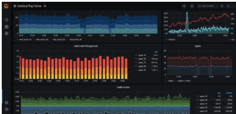
Figure: Grafana example dashboard, https://www.sqlshack.com/wp-content/uploads/2020/06/grafana-dashboard-demo.png