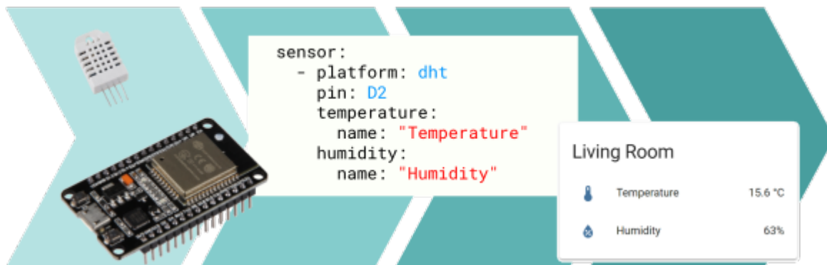
Figure: ESPHome example configuration and sensor displayed in Home Assistant, https://esphome.io/_images/hero.png

When used inside Home Assistant, the ESP32 can quickly be integrated and the sensor readings to be configured as a sensor in HA.