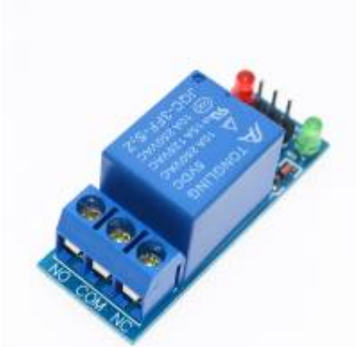
Figure: Relay module, https://www.stephenwenceslao.com/sites/default/files/1-relay-module4.jpg

A relay can safely close a circuit when activated by an external DC current. Thus this electrical switch can be activated by a controlled electrical signal.