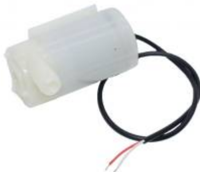
Figure: Submersible water pump, https://cf3.s3.souqcdn.com/item/2018/09/25/38/88/28/88/item_XL_38882888_151555394.jpg

The water pump is supposed to transport water from the storage tank through tubes into the soil. The pump works with an electrical motor that spins a mechanical rotational part, the rotor, which pushes water in an enclosure from an inlet to an outlet and thus creates a flow of the water.