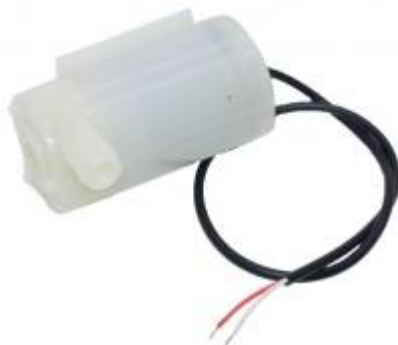
Figure: Submersible water pump, https://cf3.s3.souqcdn.com/item/2018/09/25/38/88/28/88/item_XL_38882888_151555394.jpg

The water pump is supposed to transport water from the storage tank through tubes into the soil. The pump works with an electrical motor that spins a mechanical rotational part, the rotor, which pushes water in an enclosure from an inlet to an outlet and thus creates a flow of the water.