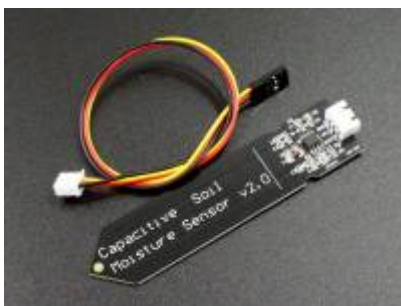
Figure: Capacitive soil moisture sensor,

Resistive measurement induces a DC current and measures electrical conductivity between two metal plates (electrodes). Soil resistance increases with drought, as less water can conduct the current. A comparator activates a digital output when an adjustable threshold is exceeded. This type of sensor is known to have issues with corrosion in long-term use, as the voltage together with the water quickly corrodes the metal of the sensor. It also has shown to lack accuracy of measurements.