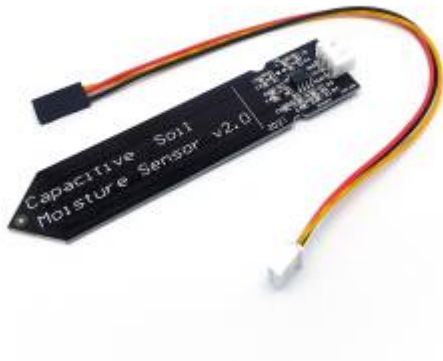
Fig2. Capacitive soil moisture sensor.

factors, such as fertilizers which decrease the resistance of the soil hence unreliable moisture readings. It is manufactured from corrosion resistant material which is a major advantage over the resistive soil moisture sensor, allowing an outstanding service life. It is equipped with a voltage regulator which allowing it to operate at voltage ranging from 3.3 to 5.5V.