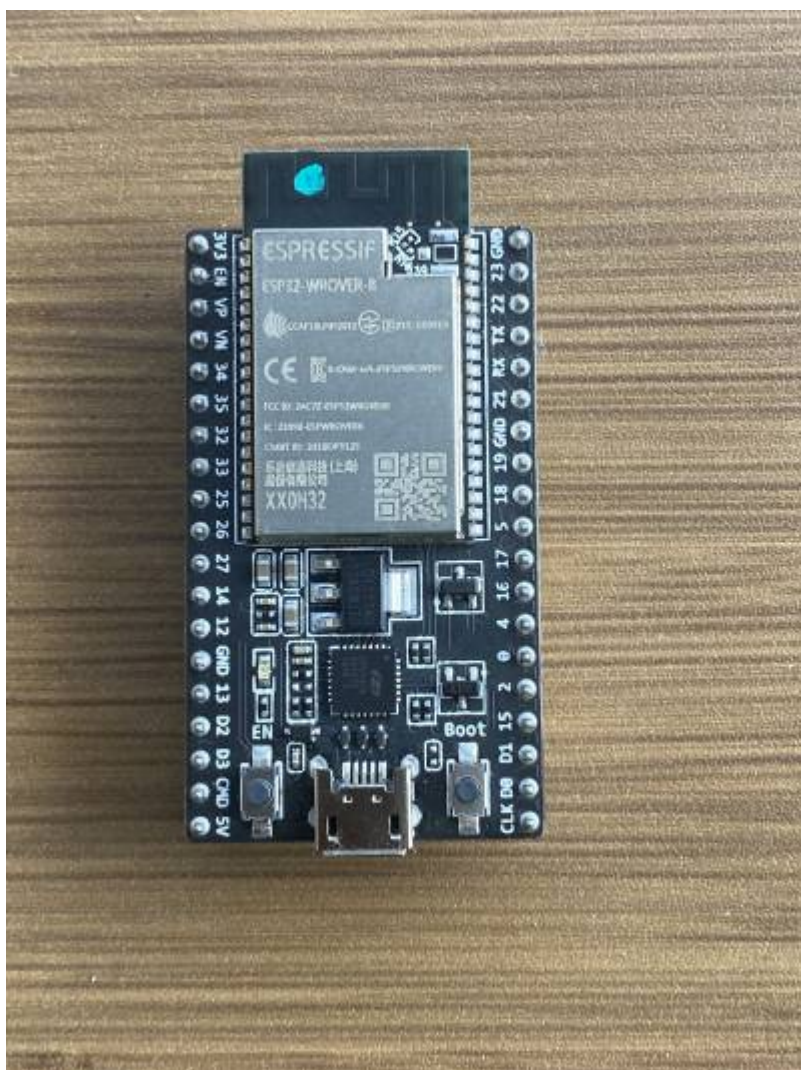
Fig.1: The ESP32 WROVER-B MODULE

With the capabilities of executing as a standalone system, the ESP32 Wrover-B Module offers vast advantages at a lower price promoting the reduction of communication stack overhead, as compared to the Arduino R3 microcontroller. It can interface with other systems to provide Wi-Fi and Bluetooth functionality through its SPI/SDIO OR I2C/UART interfaces which makes it a suitable candidate as the core microcontroller for the real time soil moisture monitoring, by establishing communication with the Internet of things and related applications. Besides qualifying for real time monitoring, the module is equipped with vast other advantages such as its capability of operating in industrial environments within temperatures between -40 to +125 degrees Celsius, giving leeway to environmental monitoring in hard weather environments. The module can be programmed using the Arduino IDE which establishes its capacity of interfacing with various environmental measuring sensors, hence transmitting the acquired data over the internet of things.