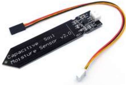
Fig2. Capacitive soil moisture sensor.

factors, such as fertilizers which decrease the resistance of the soil hence unreliable moisture readings. It is manufactured from corrosion resistant material which is a major advantage over the resistive soil moisture sensor, allowing an outstanding service life. It is equipped with a voltage regulator which allowing it to operate at voltage ranging from 3.3 to 5.5V.