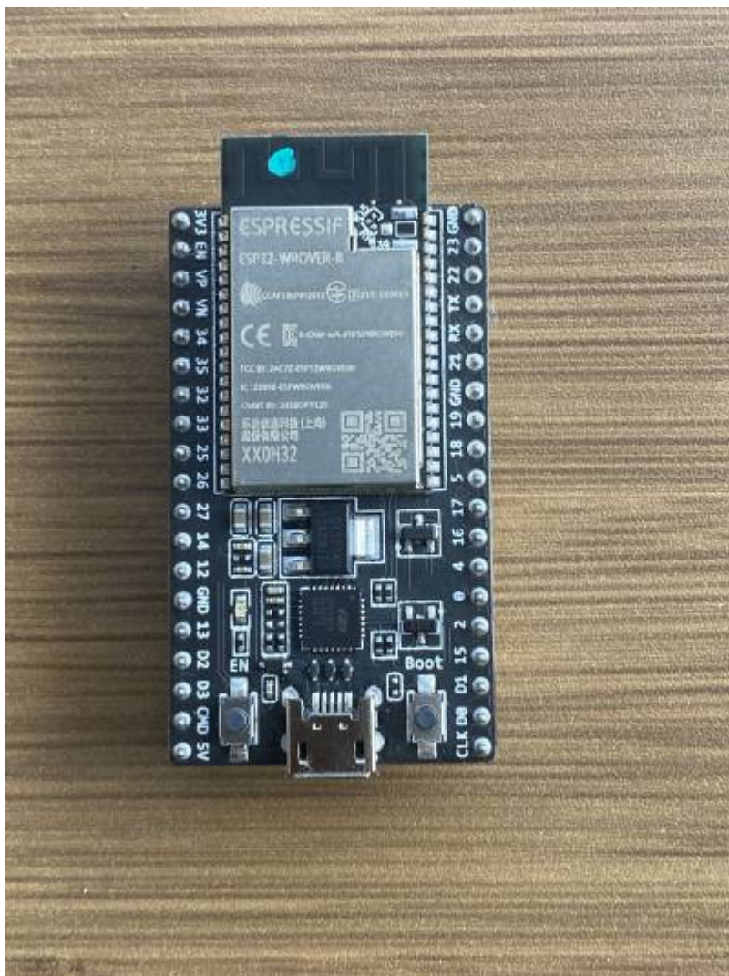
Fig.1: The ESP32 WROVER-B MODULE

With the capabilities of executing as a standalone system, the ESP32 Wrover-B Module offers vast advantages at a lower price promoting the reduction of communication stack overhead, as compared to the Arduino R3 microcontroller. It can interface with other systems to provide Wi-Fi and Bluetooth functionality through its SPI/SDIO OR I2C/UART interfaces which makes it a suitable candidate as the core microcontroller for the real time soil moisture monitoring, by establishing communication with the Internet of things and related applications. Besides qualifying for real time monitoring, the module is equipped with vast other advantages such as its capability of operating in industrial environments within temperatures between -40 to +125 degrees Celsius, giving leeway to environmental monitoring in hard weather environments. The module can be programmed using the Arduino IDE which establishes its capacity of interfacing with various environmental measuring sensors, hence transmitting the acquired data over the internet of things.