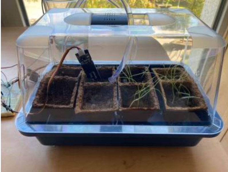
Figure 1.0 A small portable greenhouse