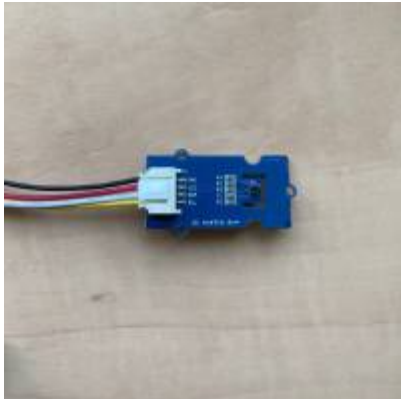
Figure 3.0 Grove Temperature and Humidity Sensor(SHT31)

The Grove Temperature and Humidity Sensor is a highly reliable and accurate sensor with a quick response. The relative humidity has an accuracy of \pm 2\% and \pm 0.3^{\circ}\text{C} for the temperature. The SHT31 is compatible with 3.3 Volts and 5 Volts meaning it can be used both with the ESP32 and the Arduino UNO and also supports I2C communication. Furthermore libraries are readily available which facilitates the use. Just like the ESP32, the SHT31 can operate under temperatures ranging from -40^{\circ}\text{C} to 125^{\circ}\text{C} .