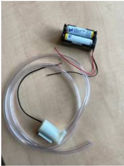
Figure 5.0 Water pump and battery pack

The 5V water pump was used together with the relay module and a battery pack that is being used to power the pump.