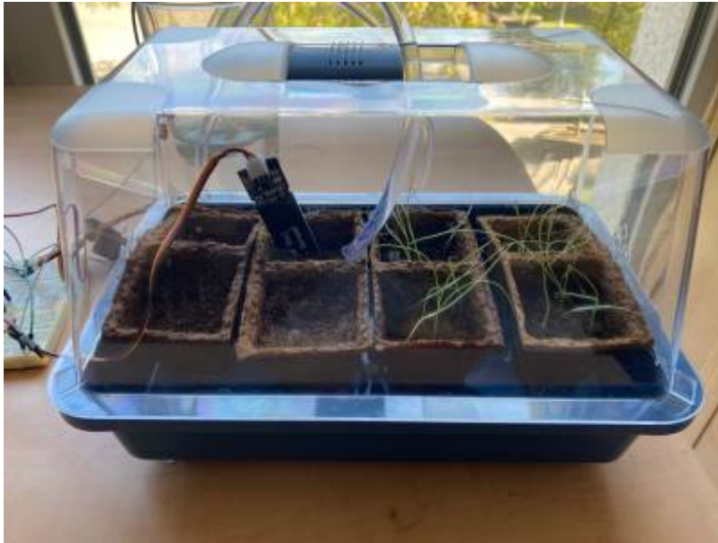
Figure 1.0 A small portable greenhouse