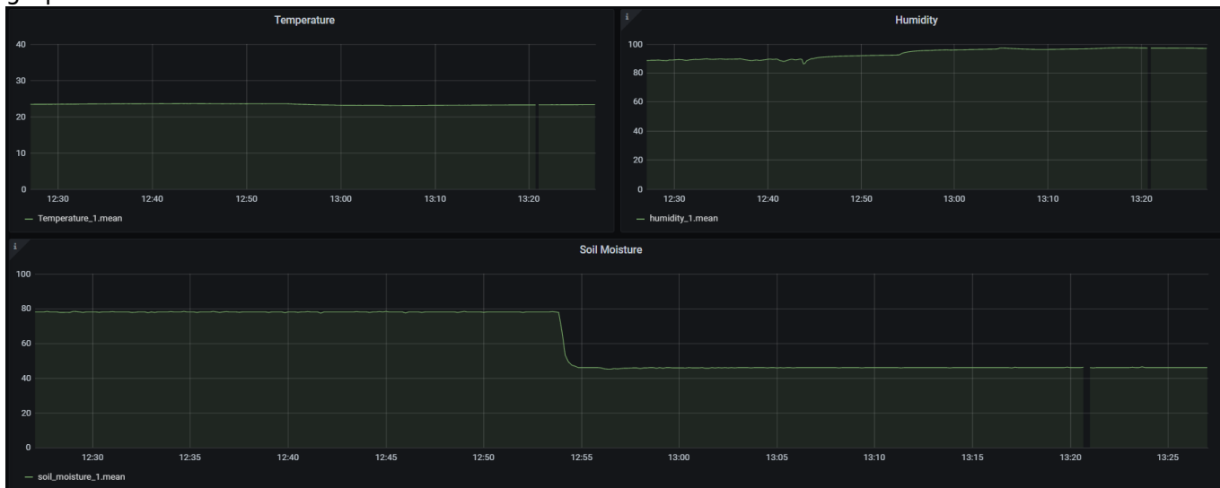
Figure 10.0 Data measurement results in Grafana

Grafana is then linked with influxdb so that the data measured can be displayed in the forms of graphs.