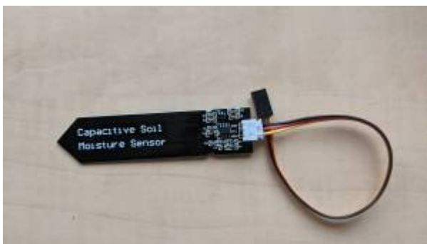
Figure 4.0 Capacitive Soil Moisture Sensor

The Capacitive Soil Moisture Sensor Module is a low-power sensor that measures the difference in capacitance caused by the changes in the dielectric that is formed by the soil and the water. The sensor's capacitance is measured by the use of a 555 based circuit (that is, it provides a single pulses over a long time) that produces a voltage proportional to the capacitor inserted in the soil. This voltage is after that measured by means of an Analog to Digital Converter which produces a number that we can then interpret as soil moisture. Due to the capacitive probe, corrosion is minimised and there is no electrical current flowing in the soil and no electrolysis is induced. It consists of 3 connectors; namely Ground, Voltage common connector, VCC (3.3V - 5.5V DC) and the analog output that is usually connected to the analog input in the microcontroller.