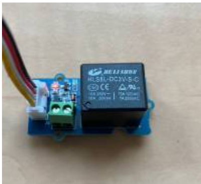
Figure 6.0 Relay Module

A Relay HLS8L-DC5V-S-C with a coil voltage(primary voltage) of 5V was used as an electrical switch to control when the pump turns on and off as the water pump has a higher voltage than the ESP32. The relay module acts like a bridge inbetween the water pump and the ESP32.