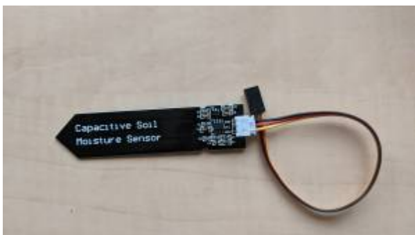
Figure 4.0 Capacitive Soil Moisture Sensor

The Capacitive Soil Moisture Sensor Module is a low-power sensor that measures the difference in capacitance caused by the changes in the dielectric that is formed by the soil and the water. The sensor's capacitance is measured by the use of a 555 based circuit (that is, it provides a single pulses over a long time) that produces a voltage proportional to the capacitor inserted in the soil. This voltage is after that measured by means of an Analog to Digital Converter which produces a number that we can then interpret as soil moisture. Due to the capacitive probe, corrosion is minimised and there is no electrical current flowing in the soil and no electrolysis is induced. It consists of 3 connectors; namely Ground, Voltage common connector, VCC (3.3V - 5.5V DC) and the analog output that is usually connected to the analog input in the microcontroller.