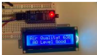
Figure 5: Liquid Crystal Display (LCD) screen (16 x 2) paired with I2C

http://www.handsontec.com/dataspecs/module/I2C_1602_LCD.pdf