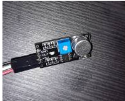
Figure 4: LM393 Microphone Sound

Specifications: The working voltage is 3.3-5V.