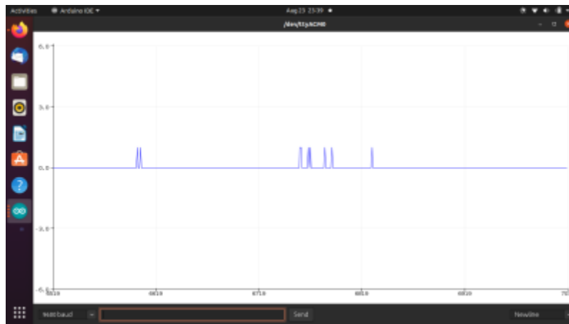
Figure 7 : Serial Plotter: Adjustment of the sensor sensitivity using the potentiometer

First, the digital output of the sound sensor is checked directly on the serial monitor (laptop), and the sensitivity of the sensor is adjusted to a reasonable level (see figure 7).