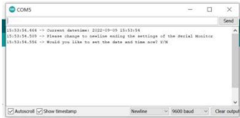
Fig. 1: Setting the time in the serial monitor

The project went through different development phases. The circuit as well as the code have been changed over time. Every sensor was tested separately before combining the system together. At first, the LCD display was set up as the basis of the project as described above. Then the DHT11 was added next. After that, the RTC was initiated and incorporated to print the time on the LCD. Lastly, the MQ135 was calibrated and added to the system. Initially, the LCD showed the heat index obtained by the DHT11, which was replaced by the CO 2 concentration. Because of lacking space on the display, the concentration is not displayed with its appropriate unit (ppm) and CO 2 had to be abbreviated as "C". The calibration and troubleshooting process for the MQ135 is further described in the chapter Results and Discussion.