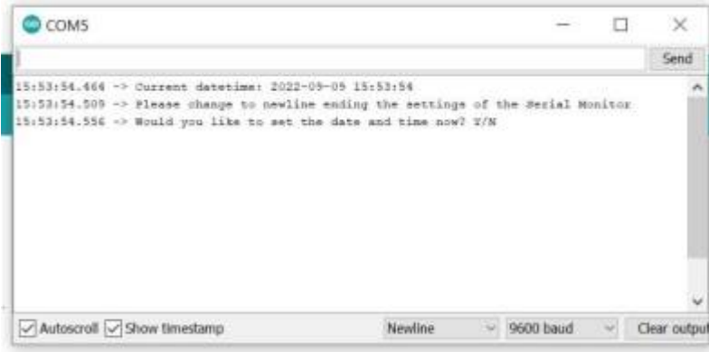
Fig. 5: Setting the time in the serial monitor

The project went through different development phases. The circuit as well as the code have been changed over time. Every sensor was tested separately before combining the system together. At first, the LCD display was set up as the basis of the project as described above . Then the DHT11 was added next. After that, the RTC was initiated and incorporated to print the time on the LCD. Lastly, the MQ135 was calibrated and added to the system. Initially, the LCD showed the heat index obtained by the DHT11, which was replaced by the CO 2 concentration. Because of lacking space on the display, the concentration is not displayed with its appropriate unit (ppm) and CO 2 had to be abbreviated as "C". The calibration and troubleshooting process for the MQ135 is further described in the chapter Results and Discussion .