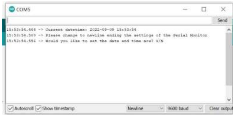
Fig. 5: Setting the time in the serial