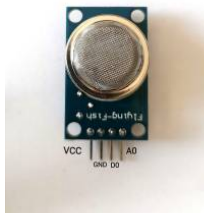
Fig. 3: MQ135 sensor Module

The MQ 135 is a sensor that measures the concentration of CO 2 and other gases in air. It needs a 5V power supply to operate and has a working current of 150mA. The module has one digital and one analog pin for data output. The material used to sense the gas concentration is SnO 2 which is a metal oxide semiconductor which changes its resistance in contact with gases. R_0 is the internal resistance of the sensor in clean air, and R_s is the resistance of the sensor in contact with different gases. With the R_0 and R_s values the concentration in ppm can be calculated. The stainless steel mesh layer as seen in figure 3 is there to protect the sensor from particular matter and other disturbances.