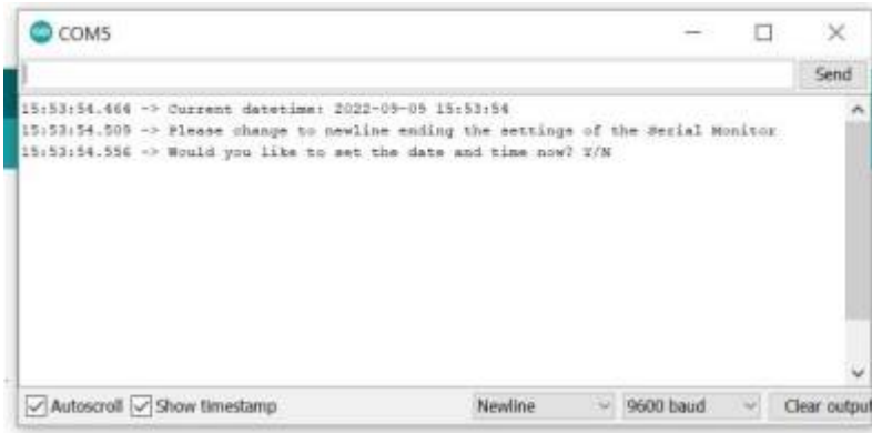
Fig. 5: Setting the time in the serial