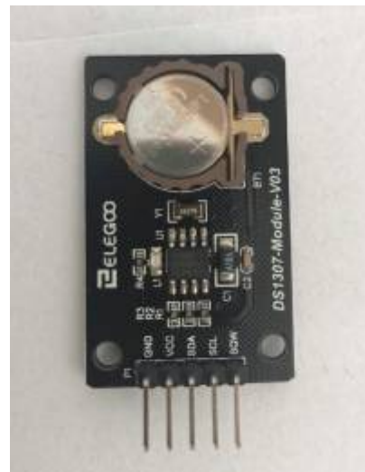
Fig. 4: RTC DS1307 Module

The DS1307 is a real-time clock module which can be used to measure time. Once the RTC is initialized by setting it to the current time including year, month and day of the week it continuously counts time. It needs a supply voltage of 5V. If the main power source is disrupted the RTC switches its power supply to a 3V button battery to ensure the continuous measurement of time.