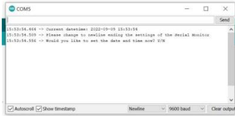
Fig. 5: Setting the time in the serial