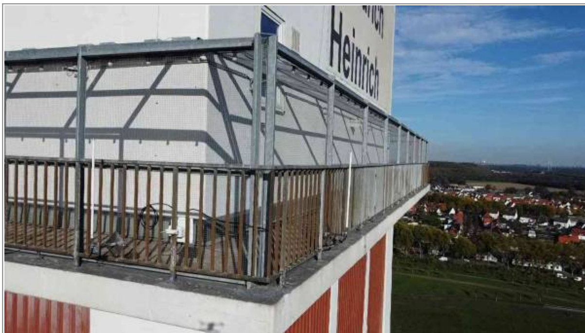
Fig.: The two rod antennas at the southwest corner of the tower of the former Friedrich-Heinrich colliery.

The installation consists of two RAK Wis Gate Edge Pro LoRaWAN Gateways, which both have 16 channels in total. This allows for many devices to communicate with them at the same time. The gateways are placed on the northern corner and on the southern corner of the tower with antennas facing in all directions then.