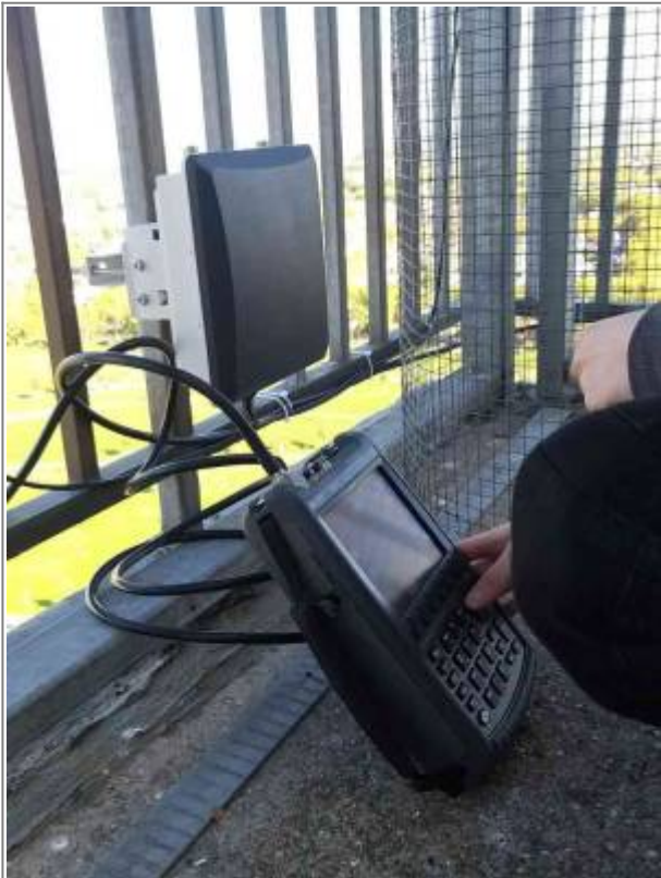
Fig.: Using a vector network analyzer to tune the antenne performance.

distance from the metal cage for each individual antenna. Therefore we used our Network Analyzer which enables us to see the frequency at which the antennas are able to receive data.