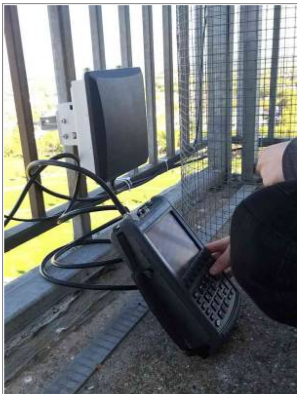
Fig.: Using a vector network analyzer to tune the antenna performance.

manufacture multiple ones made from stainless steel. These enabled us to specifically tune the distance from the metal cage for each individual antenna. Therefore we used our Network Analyzer which enables us to see the frequency at which the antennas are able to receive data.