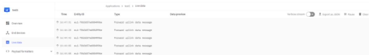
Figure 16: Select live data

The pin configuration to ensure a successful SPI communication between the microcontroller and the Lora module must be done exactly as shown in the next picture.