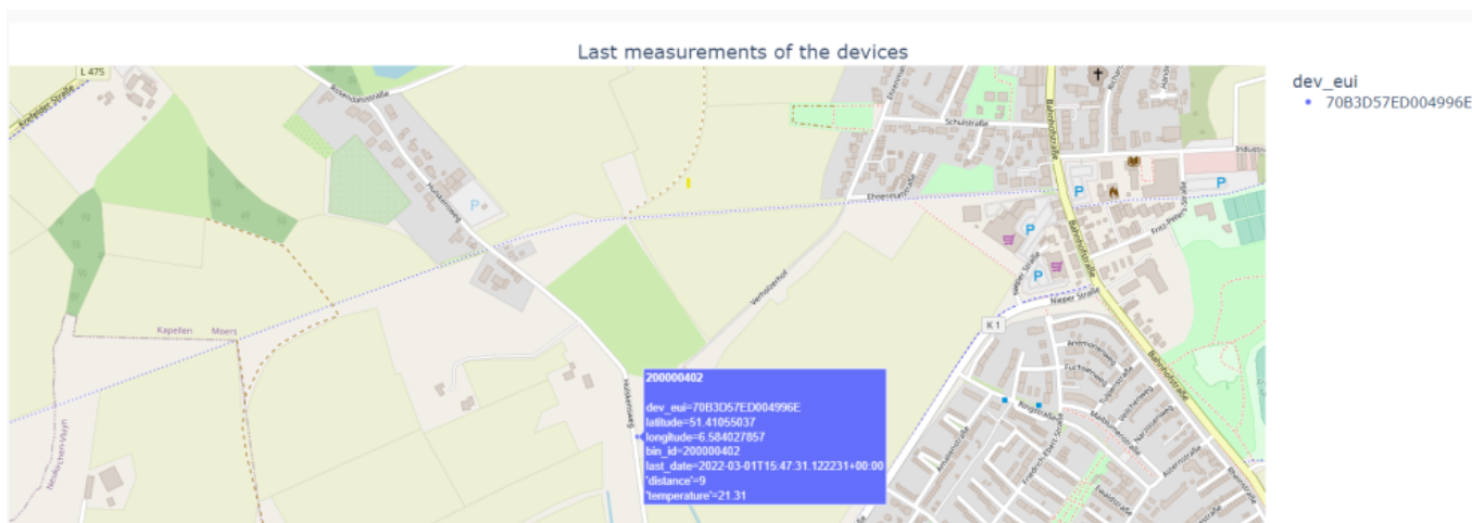
Figure 60: last measurement per device

As a result, it is now possible to call up the last measured values for each device in a pivoted manner, instead of having to decide on a measurement type as in the previous version, it is now possible to call up the last date and the corresponding measurements for all devices.