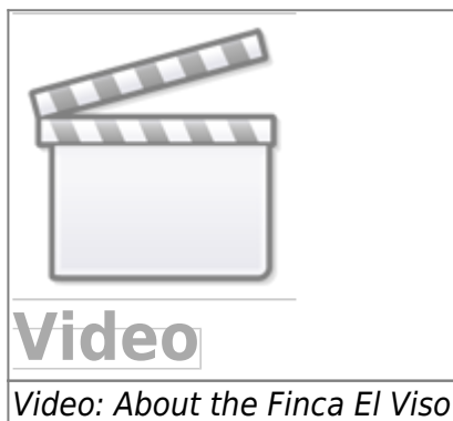
Video: About the Finca El Viso

El Viso is the perfect place to demonstrate state of the art IoT technologies supporting organic farming.