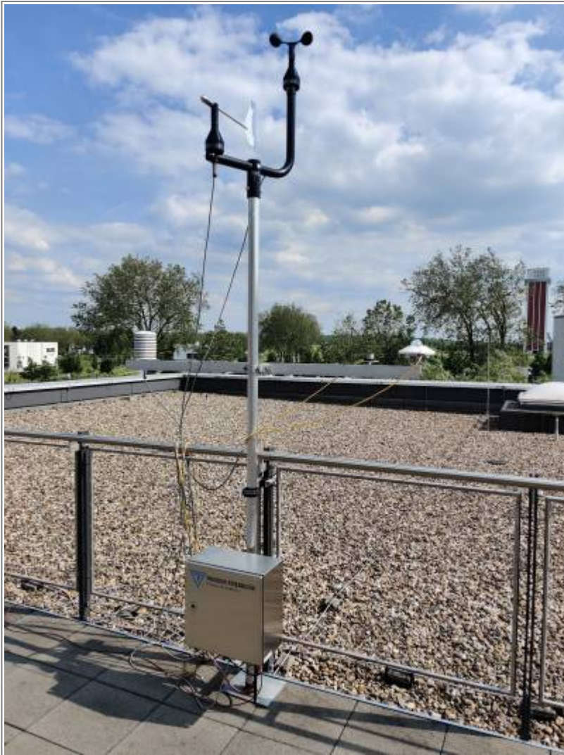
Fig.: HSRW Weather Station, Campus Kamp-Lintfort