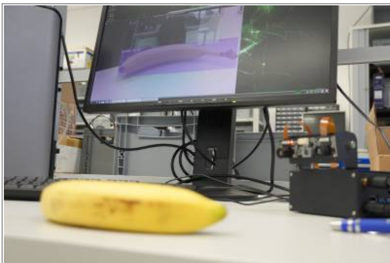
Figure 3: Banana being detected

One way to arouse the interest in children could be handing over Jetsons to the different groups of children and telling them to make their Jetson detect whatever they like to and ask them to make a note of the things or images that their Jetson could not detect correctly during the whole process so that the limitations of Jetson can be known.