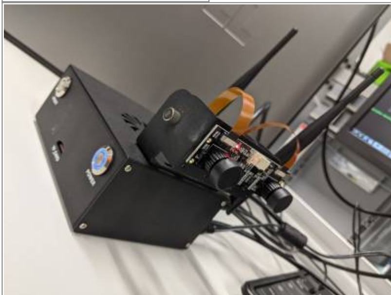
Figure 1: Nano Jetson

Object detection is the means of locating the presence of objects with a bounding box and types or classes of the located objects in an image.