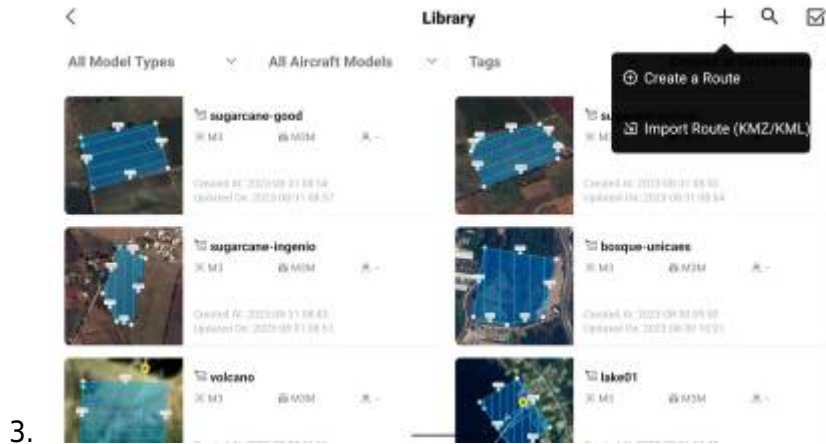
Fig. 3: Choose "Create a route"