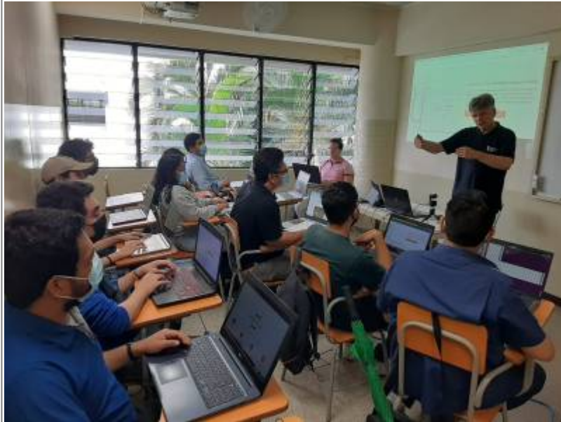
Fig.: Great audience! 😊