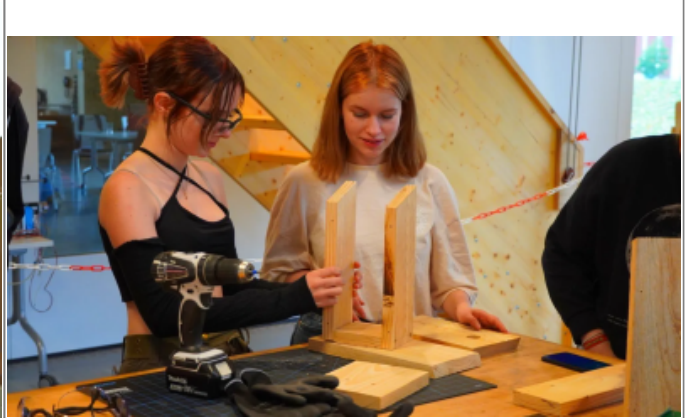
Students at work