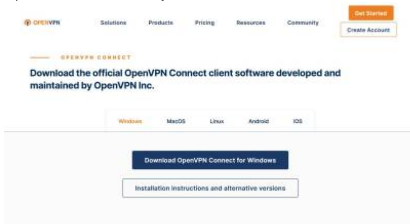
Fig. 1 If you need more instructions

on how to install the application, please click “Installation instructions and alternative versions”. There you can find some “Frequently Asked Questions” and also more information on how to do “Downloading and installing”. If you follow the steps explained on the aforementioned site, please download the application from the OpenVPN site as explained above. We do not host our