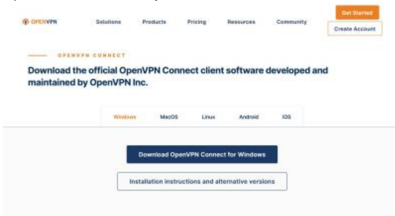
Fig. 1 If you need more instructions

on how to install the application, please click “Installation instructions and alternative versions”. There you can find some “Frequently Asked Questions” and also more information on how to do “Downloading and installing”. If you follow the steps explained on the aforementioned site, please download the application from the OpenVPN site as explained above. We do not host our