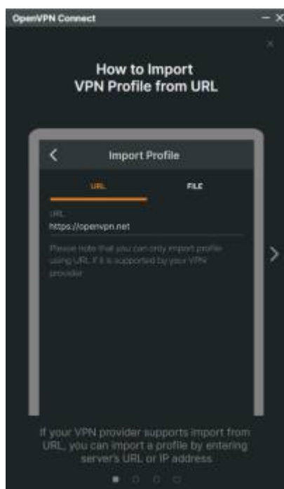
Fig. 3 It will show you guide on how to use the app. We will use the "import from file"-feature. To exit the guide, go through the four pages ones or hit the "Cross"-Icon in the top right corner. You will also need to expect some stuff given by OpenVPN.