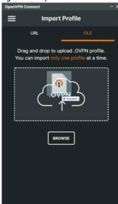
Fig. 2 Everything besides the username and password will be automagically be filled out for you. You can now fill in the username and password which are provided by our on-site team. To type in the password just check “Save password”. After all of that, you can now just click connect.