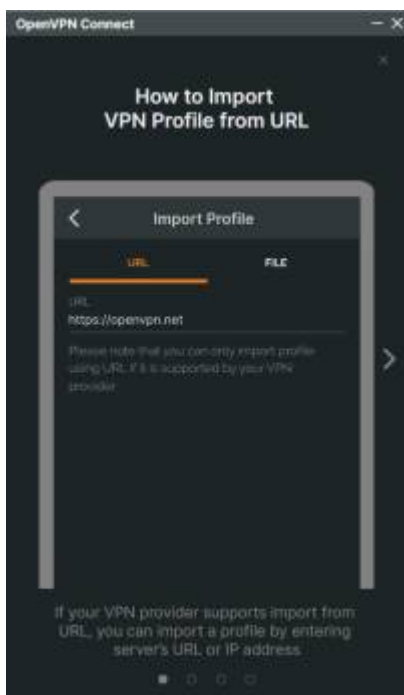
Fig. 3 It will show you guide on how to use the app. We will use the “import from file”-feature. To exit the guide, go through the four pages ones or hit the “Cross”-Icon in the top right corner. You will also need to expect some stuff given by OpenVPN.