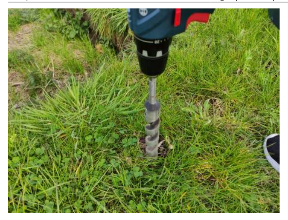
The second time, I got to drill 50cm, which is the total length of the bit.