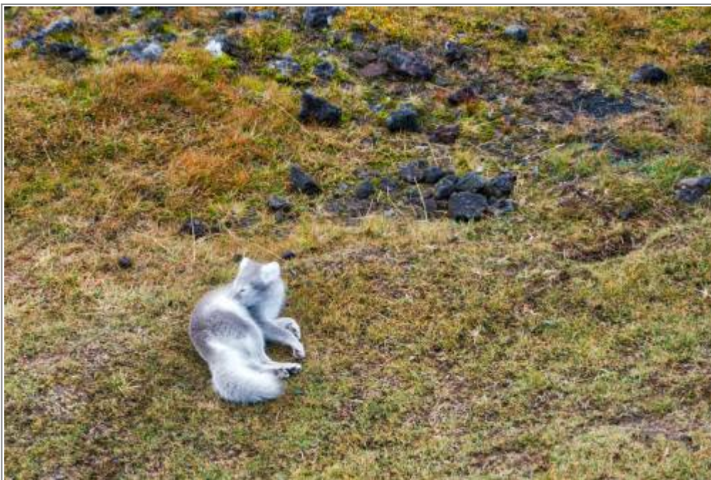
Photo: Polar Fox on Iceland, Sept. 2019