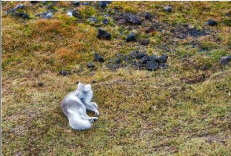
Polar Fox on Iceland, Sept. 2019