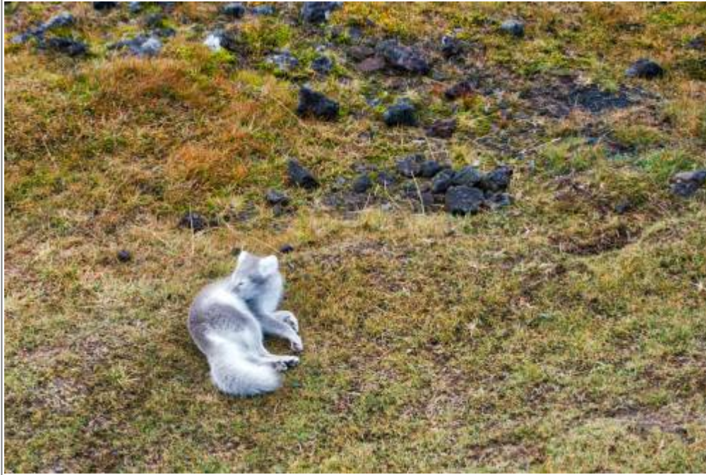
Photo: Polar Fox on Iceland, Sept. 2019