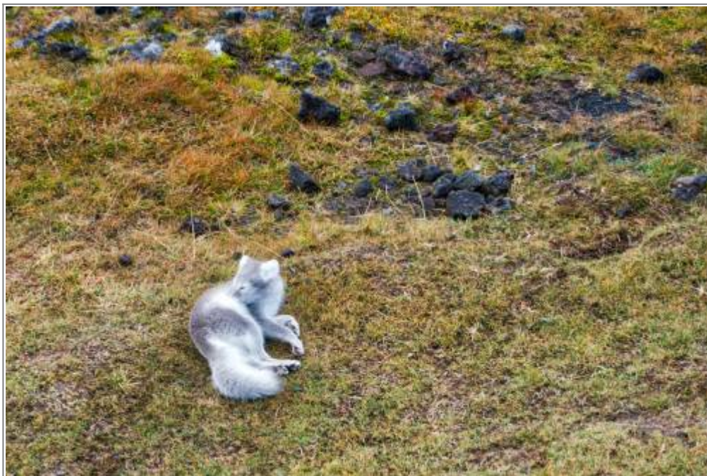
Photo: Polar Fox on Iceland, Sept. 2019