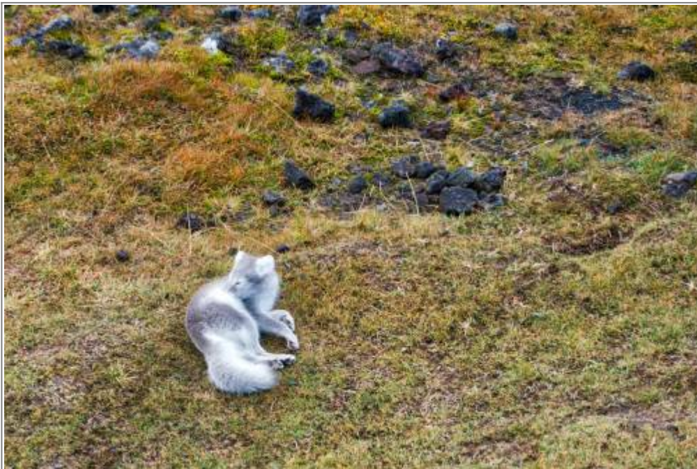
Photo: Polar Fox on Iceland, Sept. 2019