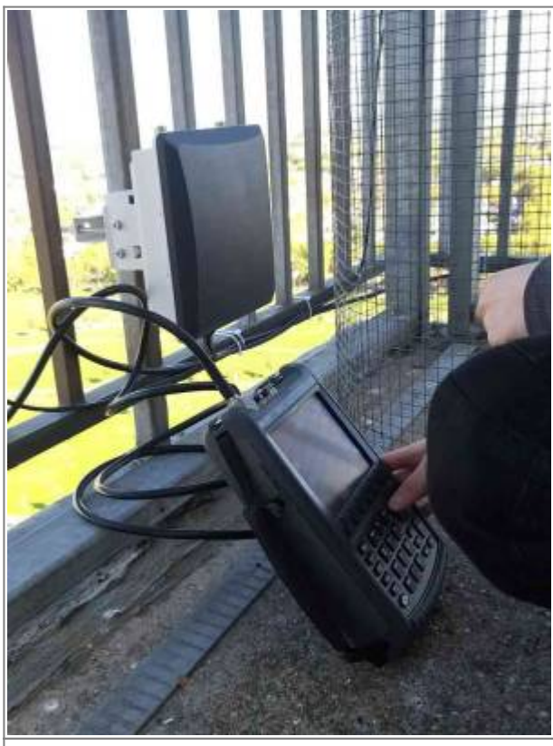
Fig.: Using a vector network analyzer to tune the antenna performance.

manufacture multiple ones made from stainless steel. These enabled us to specifically tune the distance from the metal cage for each individual antenna. Therefore we used our Network Analyzer which enables us to see the frequency at which the antennas are able to receive data. Thanks to RF Frontend GmbH to support us with antenna tuning!