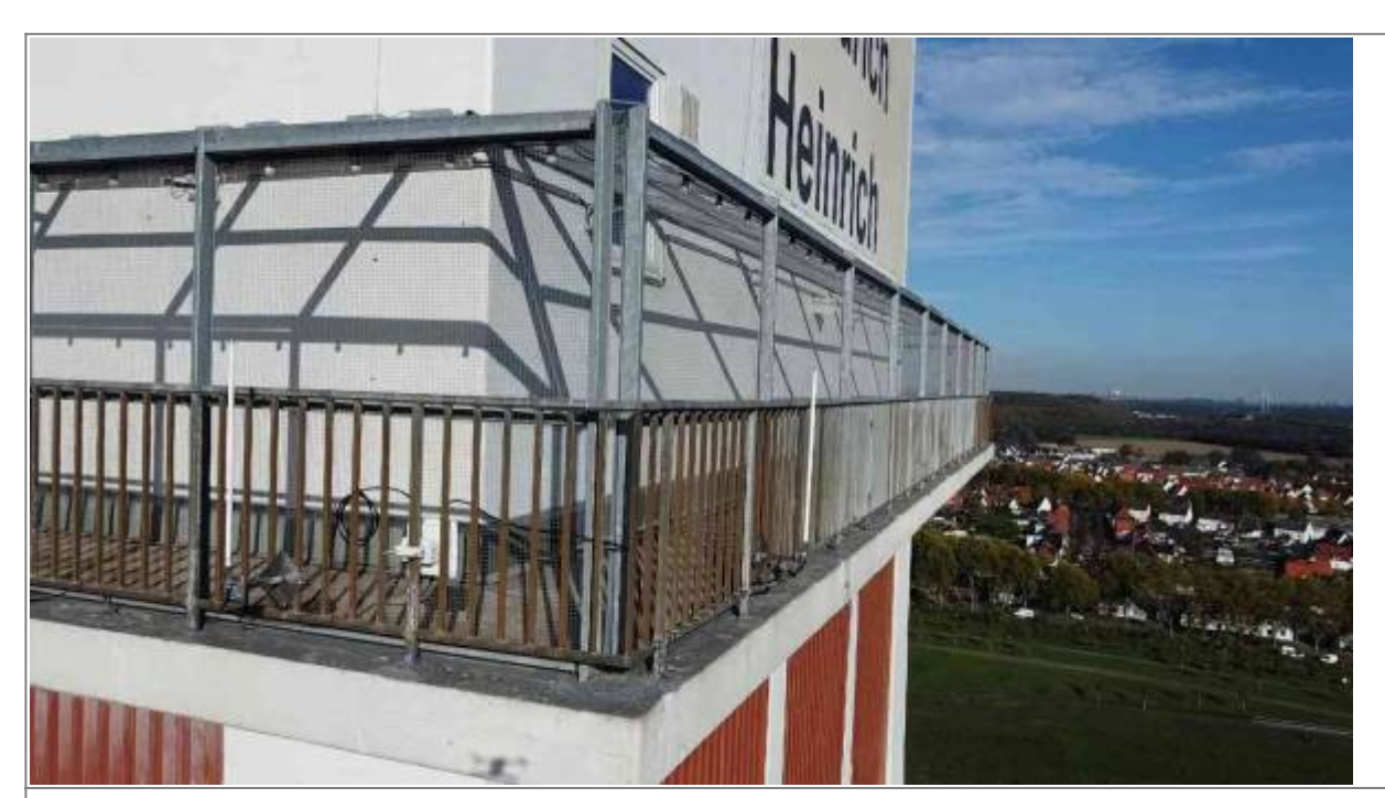
Fig.: The two white rod antennas at the southwest corner of the tower of the Friedrich-Heinrich colliery.

This allows for many devices to communicate with them at the same time. The gateways are placed on the northern corner and on the southern corner of the tower with antennas facing in all directions then.