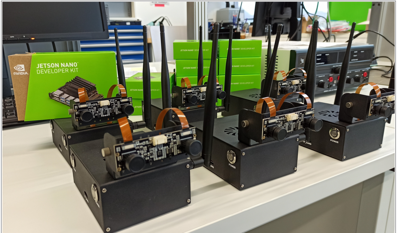
Powered by NVIDIA Jetson Nano

Design and create teaching material (brainware, software and hardware) for AI / ML / DL / CV in schools.