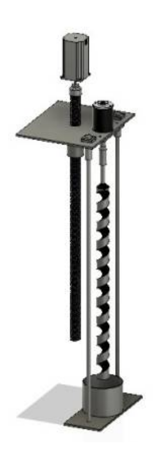
Check 3D model here