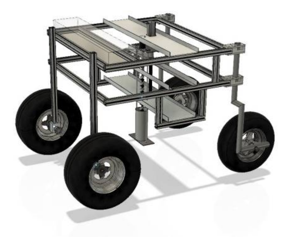
Check 3D model here