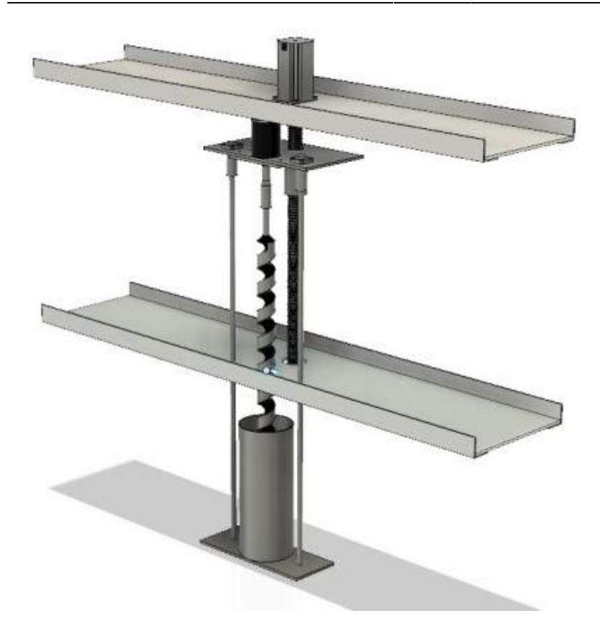
How it would look like on the FarmRobot:

2024/05/19 12:58 5/9 Soil sampling machine