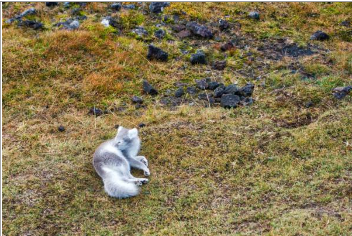
Photo: Polar Fox on Iceland, Sept. 2019