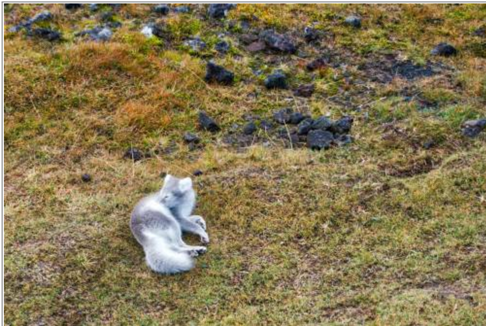
Photo: Polar Fox on Iceland, Sept. 2019