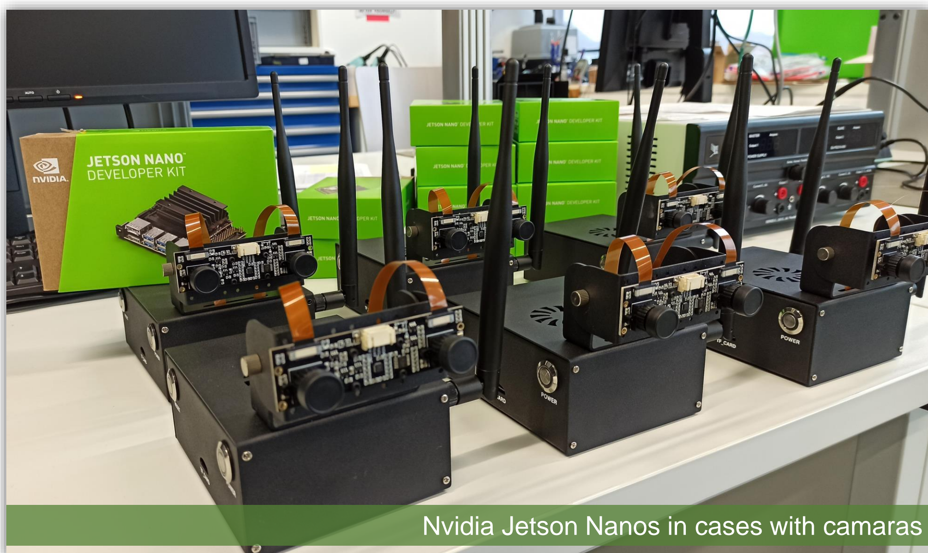
Nvidia Jetson Nanos in cases with cameras

Artificial intelligence is a prevalent technology that entails both, opportunities and risks to society and the environment. It is crucial for students to acquire these competences in school, enabling them to master this technology at an early age. This allows them to avoid being dominated by AI, to demystify AI, and to develop the ability for critical reflection in assessing the opportunities, applicability, and limits of AI for problem solving. The usability of many AI toolkits is continuously improving. They require less and less expert knowledge to utilize them effectively. This simplification can be taken further. Our ambition is to hide the complexity of AI in the background and provide easy-to-use programming and user interfaces as frontends.